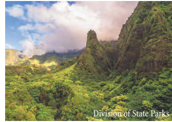
Division of State Parks

Maui's Iao Valley State Monument will close 01 Aug-15 Jan as it undergoes the final phase of a slope stabilisation project and parking lot improvements. The monument can normally be accessed via a 1km walk, with entry starting from USD5 per person, excluding parking. See details HERE .