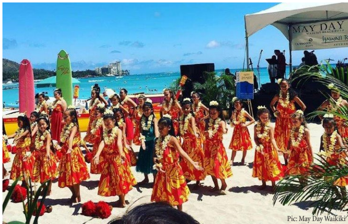
Pic: May Day Waikiki

Qantas has flights to Australia on sale to 04 May, with ow fares from $199 to Sydney/Melbourne/Brisbane, Perth from $399 and Adelaide or Cairns from $299. See qantas.co.nz/agents