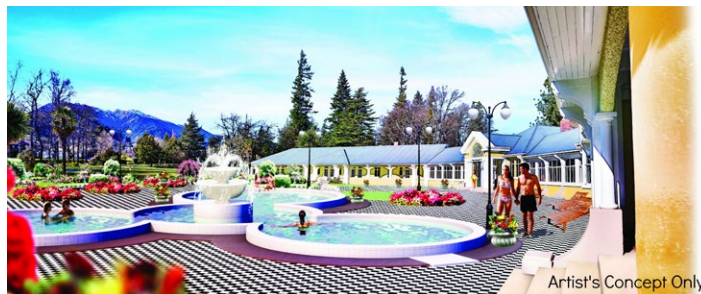
Artist's Concept Only