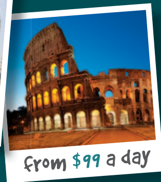
From $99 a day