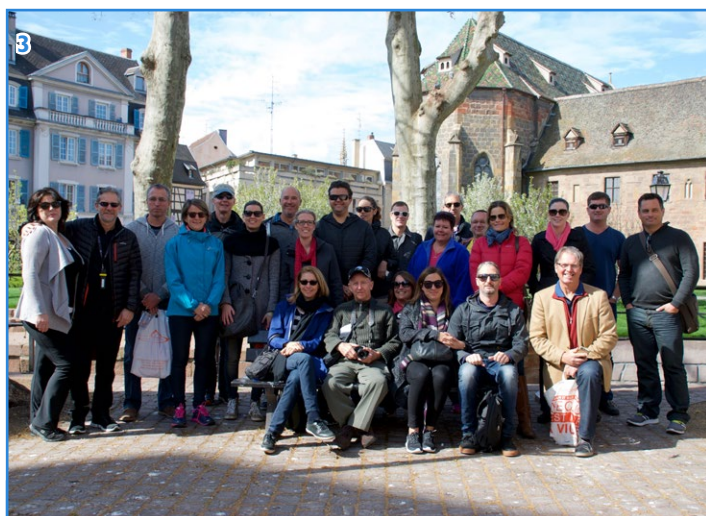
1 The 'Little Venice' district of Colmar. 2 The picturesque canals of Strasbourg. 3 Some of the 70 guests aboard Avalon Waterway's New Zealand christening cruise, in the town square of Colmar.

They were joined by broadcaster Judy Bailey, who had christened the Avalon Imagery II in an event dedicated especially to the New Zealand market.