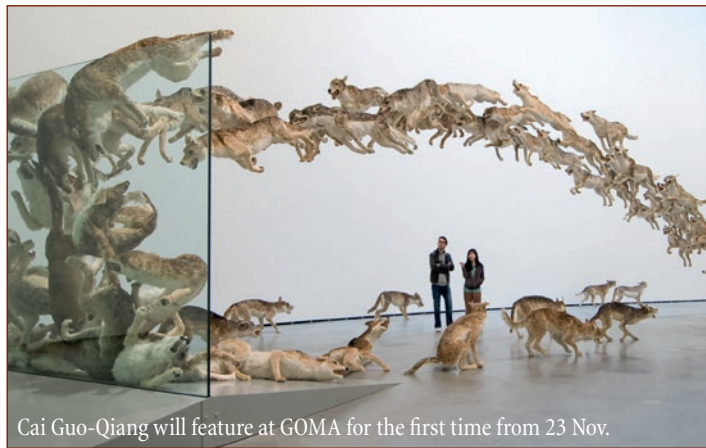
Cai Guo-Qiang will feature at GOMA for the first time from 23 Nov.

While the New Zealand market is already the number one visitor arrival market for Brisbane, Tourism Events Queensland is keen to boost arrivals even further with a focus on enticing potential visitors to major events being staged in the city.